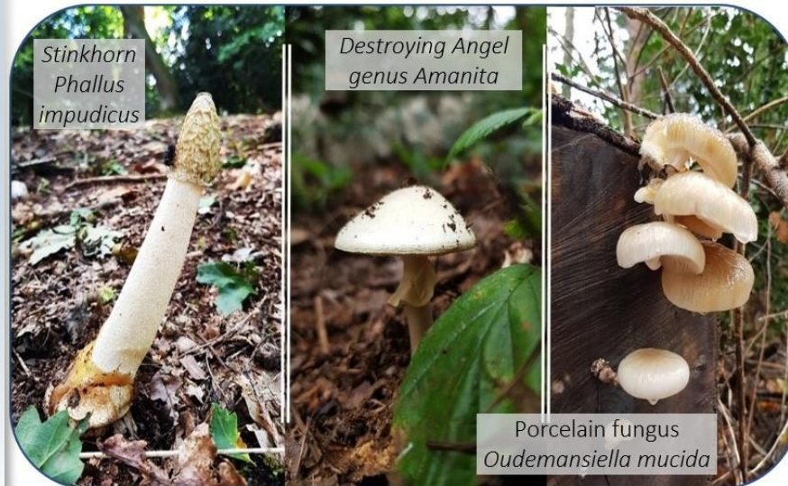
Stinkhorn Phallus impudicus

Dates for your diary - kids half-term activity on Wednesday October 25 th and then one more Action Day for volunteers on November 26 th – open to all.